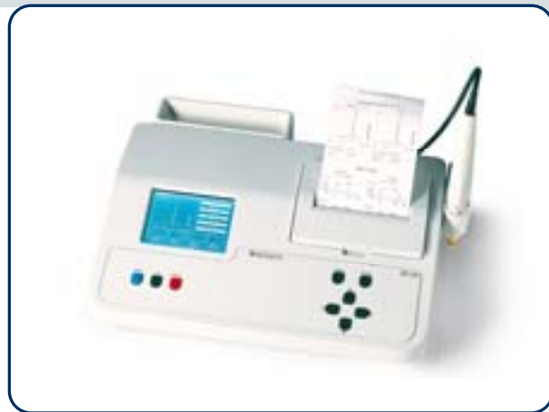
MI 24 with optional connector cover